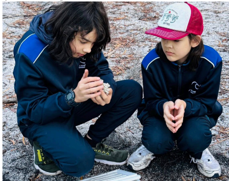
Photo courtesy of Jen Lownes: Hands-on learning about local habitats

Council commends the St Helens Serpentarium and its passionate team of Junior Keepers and volunteers for their leadership and dedication to protecting our local environment.