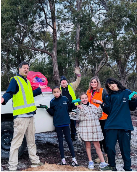
Volunteers removing harmful waste from the bush

Volunteers and Junior Keepers from the St Helens Serpentarium, recently took part in their quarterly “I CARE” bush activity in Stonyford, St Helens. The group ventured into the local bushland to explore and learn about the delicate ecosystems that make our region so special. From discovering a piece of bark teeming with life – including millipedes, spiders, ants, and roly-polies – to sharing ideas and theories about how nature works together in balance, this hands-on experience inspired curiosity and respect for our environment. Importantly, the team also rolled up their sleeves to tackle a disappointing but vital task – collecting dumped rubbish from our natural spaces. Thanks to their efforts, a large pile of harmful waste including cigarette butts, dirty nappies, and other pollutants was removed from the area.