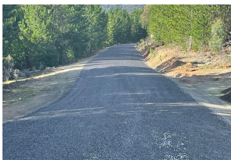
Photo: Mathinna Plains road

Keep up to date on Council activities and projects by joining our email database.