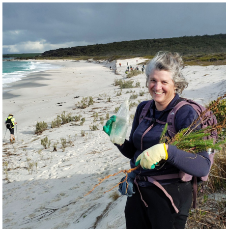
Photo: Volunteer helping care for our coastline.

Our famous Irapuna / Bay of Fires coast got its annual clean up by the Irapuna Community Weekend in August. Over four days and 50km of beach walks 130 volunteers removed 55kg of marine debris and pulled out over 32,000 sea spurge plants, an invasive beach weed. Participants come from all over Tasmania to enjoy this spectacular coastline and care for it together.