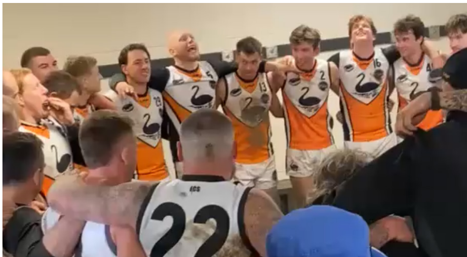
Post-game victory - Swan boys celebrating their win- taking them to the 2025 Grand Final.

The East Coast Swans are through to the 2025 Grand Final after a fantastic 97 to 50 semi-final win over the Perth Magpies, who had gone undefeated all season. The team's performance showed just how strong and skilled they are, setting the stage for an exciting finish to the season.