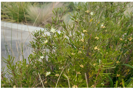
Photo: Davies' Waxflower growing in Quail Street

Threatened Plants Tasmania and NRE Tasmania are looking for volunteers to help plant seedlings of Davies waxflower near St Helens this September. Davies waxflower ( Phebalium daviesii ) is unique to St