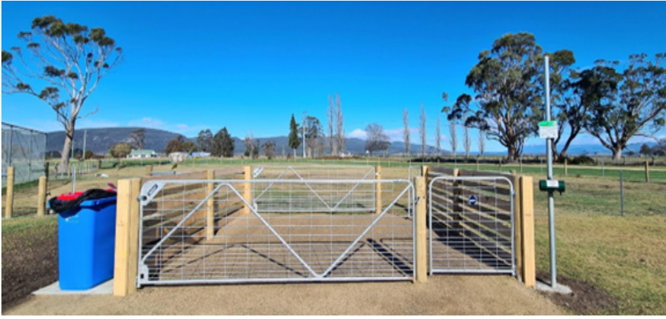
Photo: The new dog park in St Marys – a safe and fun space for your furry friends to play and socialise!

Exciting news for St Marys dog owners — the long-awaited Dog Park is officially open! Located near the new Multi-purpose and Evacuation Centre off Harefield Road, this space gives our four-legged friends the freedom to run,