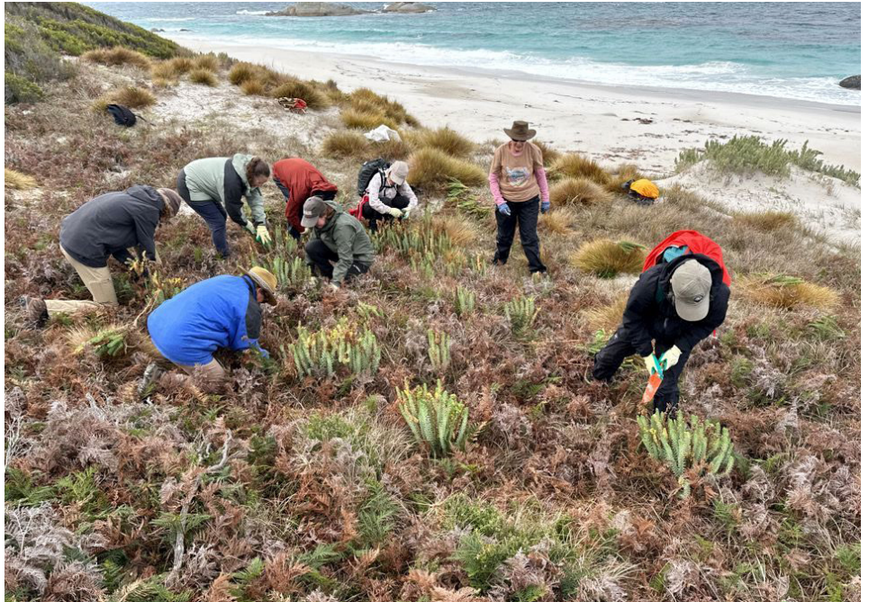
Photo: Volunteers unite to protect the Irapuna/Bay of Fires coastline.

Our famous Irapuna / Bay of Fires coast got its annual clean up by the Irapuna Community Weekend in August. Over four days and 50km of beach walks 130 volunteers removed 55kg of marine debris and pulled out over 32,000 sea spurge plants, an invasive beach weed. Participants come from all over Tasmania to enjoy this spectacular coastline and care for it together.