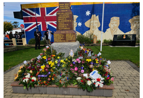
Wreaths laid at the St Helens service in Memorial Park

community for their time and effort in organising the services and to the community for coming together.