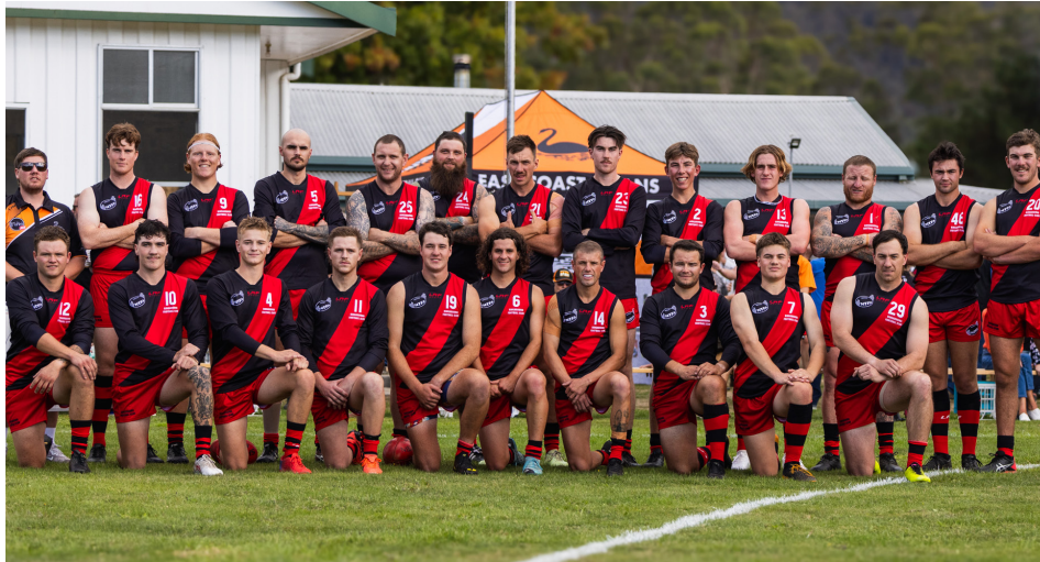
Senior Swans in the Ringarooma guernseys