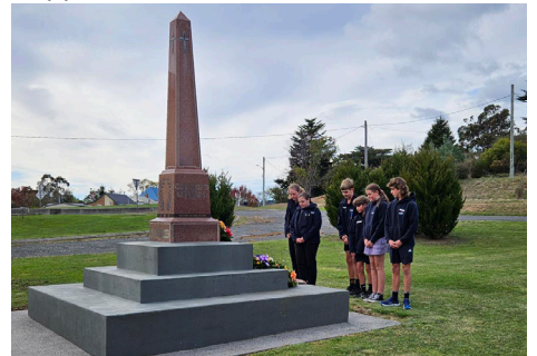
Students pay their respects in Fingal veterans, capturing their stories and experiences to share ahead of Anzac Day. Thank you to everyone for making the services a success, those in the

This year, the ABC network decided to shine a spotlight on St Helens to show what the East Coast does to honour and support veterans. The ABC met with