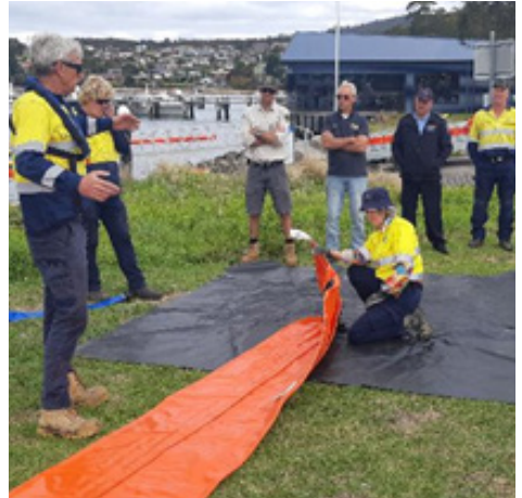
Photo: EPA trainers demonstrating useful skills for spills

skills and processes for responding to marine fuel and oil spill incidents that are small or distant state and national response capacity can't get to quickly.