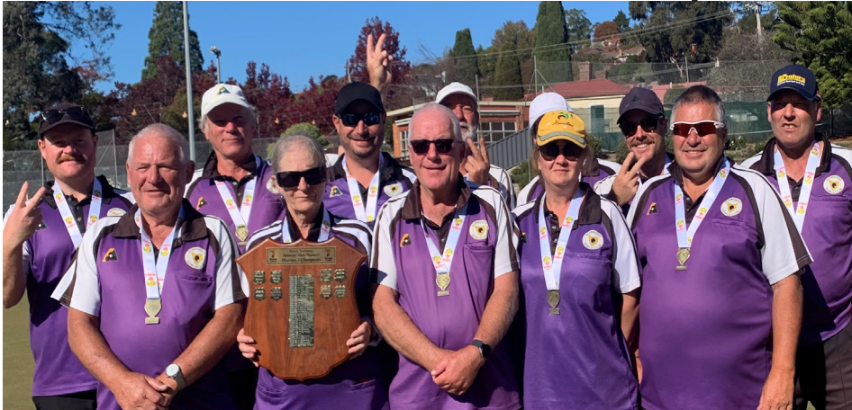
Photo: Reigning State Champions- Scamander Bowls Club members celebrating their win.

Scamander Bowls Club have won back to back the State Championships division 3. Their path to victory was cemented when they played Swansea in the East Coast bowls final and won on 13 April. This means Scamander have now won the last three finals which is quite a feat as previously they hadn't won a final for 21 years. This win advanced them to the State Finals on 20-21 April against the premier teams