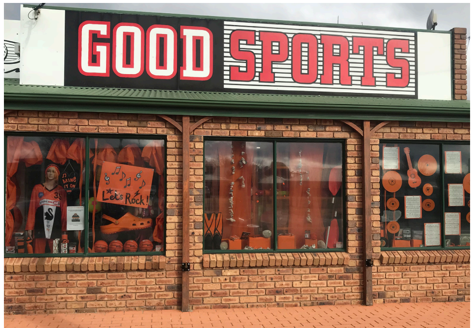
Good Sports in St Helens is setting the bar high with their efforts for the Paint the Town Orange competition.