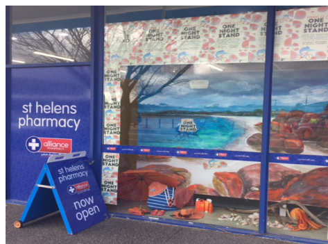
The St Helens Pharmacy looking fantastic!

We are almost ready to publicly release the traffic management plan for the One Night Stand, we are just waiting on final approval from State Growth. Once this is approved we will upload it to our website and share through Facebook.