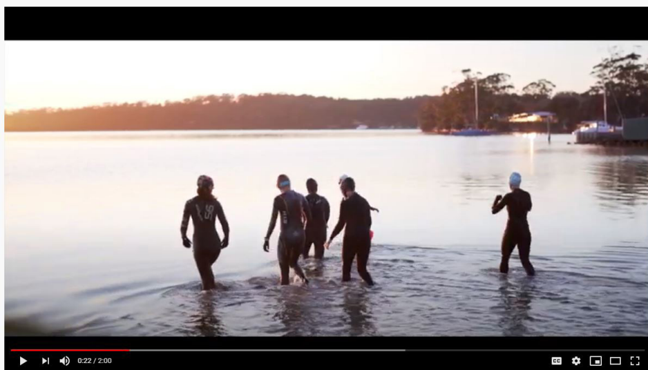
Above: A screen shot from the video entry featuring St Helens' Happy Fish swimmers at Beauty Bay.

Any businesses wanting to access the video or other material for their own promotion can contact Jayne. richardson@bodc.tas.gov.au.