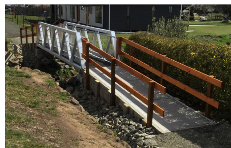
The new pedestrian bridge in Fingal