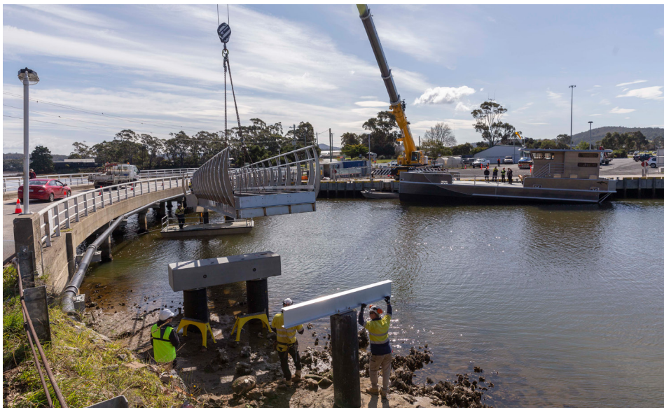
Contractors lifting a section of the new pedestrian bridge in to place.