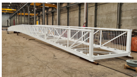
The New pedestrian bridge for Four Mile Creek.