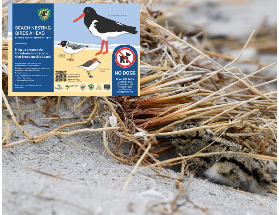
Pictured above: The new signage and a pied oystercatcher chick sheltering - Photo credit Eric Woehler.

The start of September means the start of shore bird breeding and nesting. It also means it is time for us all to think about what we can do to help these vulnerable and threatened shore birds to have a successful breeding season.