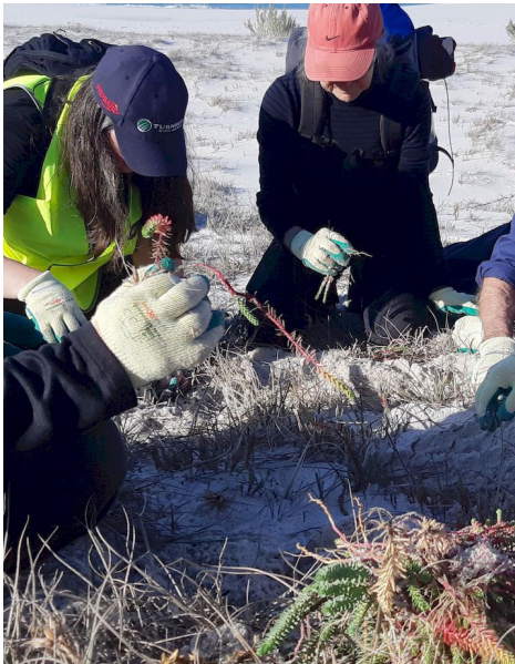
Volunteers removing sea spurge

Approximately 46,000 invasive sea spurge plants were removed from 50km of the Irapuna coastline during this year's Irapuna Community Weekend in August. The 120 walkers taking part in the five walks over the four days of the event also removed 51kg of marine debris from beaches between Stumpys Bay in Wukalina/Mt William National Park, past Eddystone Point and all the way to The Gardens.