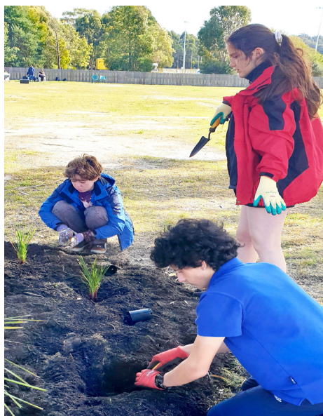
St Helens students planting seedlings

Students from the Hands On Learning Group at St Helens District High School planted over 100 native tussock seedlings for National Tree Day at the St Helens Dog Yards. The understory plantings add to the shade, shelter and screening provided by trees and shrubs planted there by students from the school in 2013 for National Tree Day. The Hands On Learning Group designed and planned the revegetation project over several months with Council's NRM Facilitator and Works & Infrastructure Department. They also baked a yummy lunch for everyone for planting day. Thank you for all your efforts!