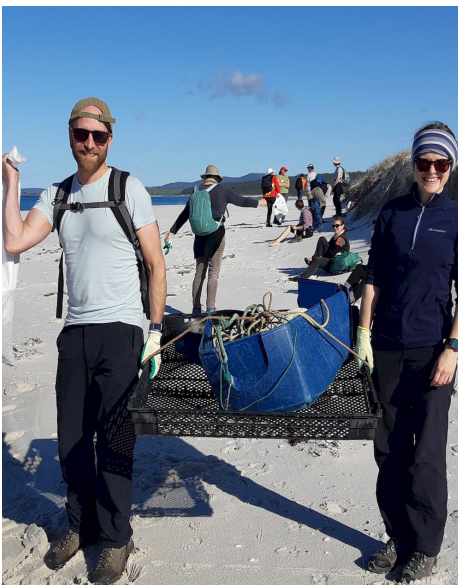
Volunteers removing marine waste

and cleaning up the marine litter on the beaches. We're proud to be a supporter of this annual event with Friends of Irapuna Coast Wildcare Group, Tasmania Parks and Wildlife Service, Aboriginal Land Council Tasmania, Tasmanian Walking Company, NRM North, Life's an Adventure, Friends of Eddystone Point Lighthouse and Ansons Bay Progress & Planning Association. This year, Irapuna Community Weekend was part of National Science Week 2023 and received a grant from Inspiring Tasmania for free bus transport by Calows Coaches.