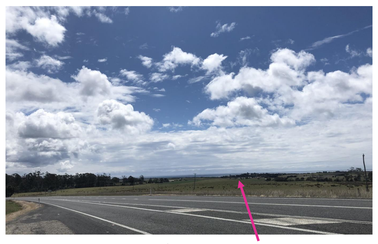
Figure 4. View from Esk Highway. Glencoe