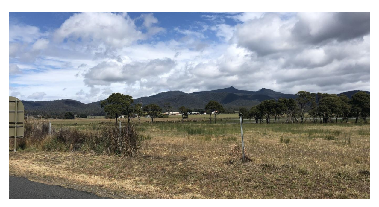
Figure 3. View from Falmouth Road at southern edge of village.