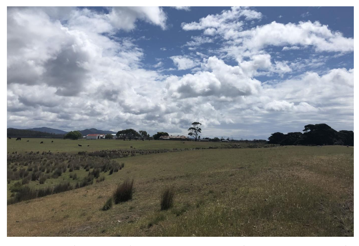
Figure 2. 330m west of property access facing north. RV Park will be in the foreground. Glencoe is middle, farm buildings are to the left and existing macrocarpa's that run parallel to the highway are to the right.