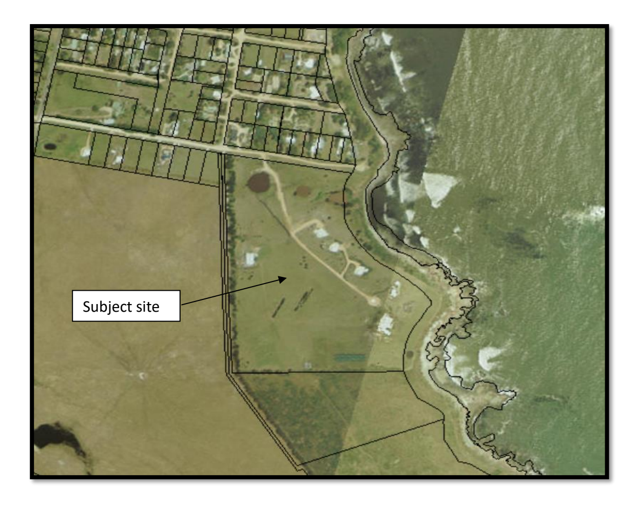
Site Photos - 20 August 2019

Application is made for the construction of 15 new visitor accommodation units, conversion of one (1) recreation building to visitor accommodation (unit 8), conversion of one (1) shed to manager's residence (unit 18) and four (4) existing visitor accommodation units (units 4-6 & 9) (1 of which was used by onsite manager previously) at 36 Franks Street, Falmouth. Visitor Accommodation use of the proposed units in the Environmental Living Zone of Falmouth is a discretionary use with qualifications "if not for holiday letting of an existing dwelling", under Table 14.2 of the Break O'Day Interim Planning Scheme 2013 .