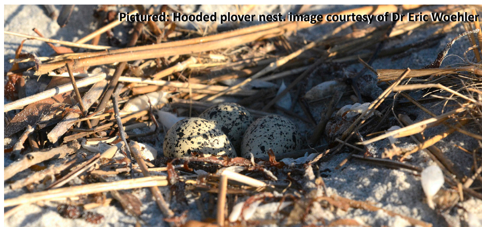
Pictured: Hooded plover nest.

The Hooded Plover Project is supported by NRM North through funding from the Australian Government's National Landcare Program.