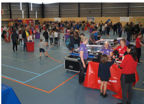
The Science Questacon was a huge success.

Council have also been successful in receiving a grant to fit out the new kiosk at the stadium with a full commercial kitchen which is something our local sporting groups and associations have been pushing for and we are pleased to be able to accommodate this.