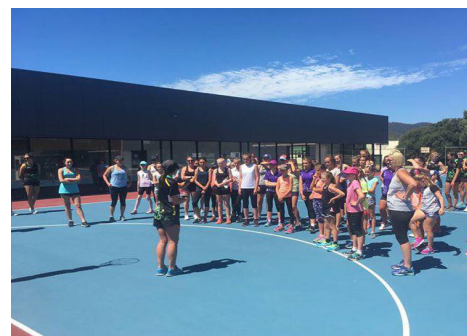
Netball Clinics at the stadium are always well attended.