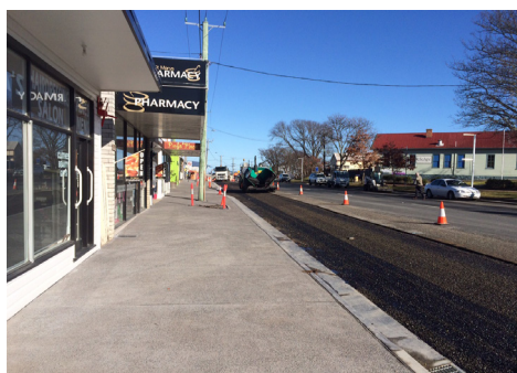
Pictured above is Stage 1 of the St Marys Streetscape.

Please be aware of our workers in the area and obey all signage.