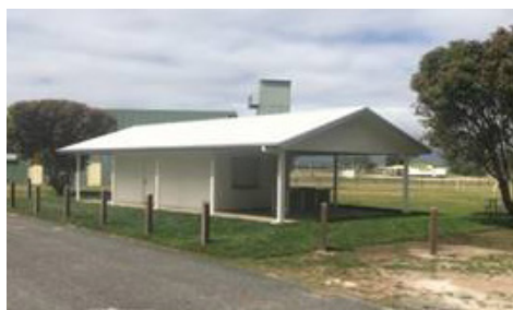
The new storage and BBQ facility at the St Marys Sports Complex.