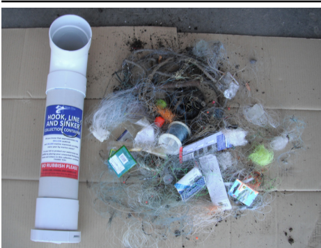
Some of the fishing waste collected in the Hook, Line and Sinker containers.

For further information please visit www.dpipwe.tas.gov.au .