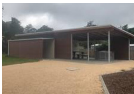
The new BBQ and toilet facilities at St Marys Lions Park.