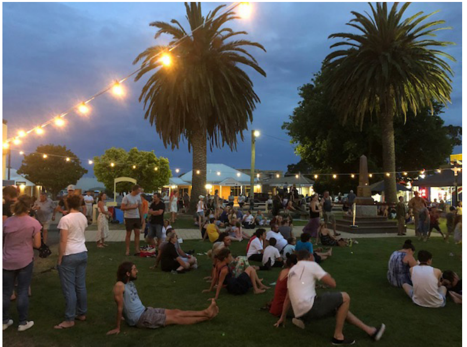
The Memorial park decked out in festoon lighting for the Australia Day Eve Twilight Market.

The Council and the local community are keen to see what the future holds in relation to the old St Helens Hospital. With the new hospital in the final stages of preparations for an opening in the next few months, the future of the old hospital is something which needs to be decided. For several months Council Officers have been making it clear to the Department of Health and Human Services that the community and Council would like community consultation to occur and we had a tentative timeframe in place with DHHS. Then a couple of weeks ago we were advised by DHHS that the future of the old hospital would be dealt with by the Department of Communities Tasmania. This was quite frustrating given the work which had gone into working with DHHS. Subsequently we have met with Communities Tasmania to discuss the community consultation process and it is good to be able to advise that this is now back on track and will occur over the next couple of months. A concern that we had was that the old hospital would be neglected once the new hospital became operational but we have been reassured by both departments that arrangements are in place for a caretaker and maintenance to occur.