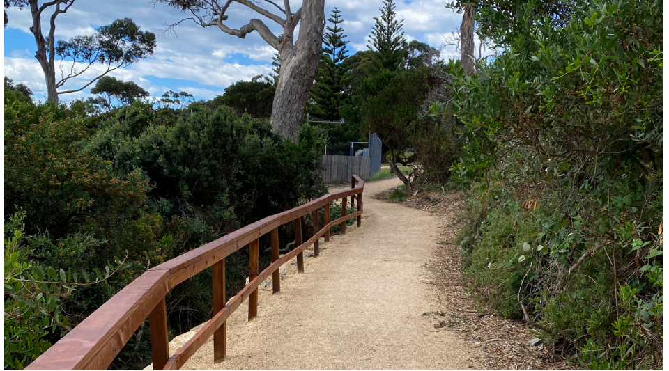
Pictured above: A section of the new walkway at Binalong Bay

If you haven't already tested out the new pathway at Binalong Bay make sure you do!