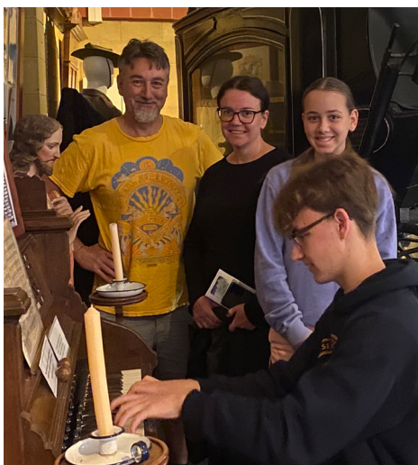
Photo: Family from Bendigo, Victoria

What happens when the weather turns here on the East Coast and there is a town full of visitors wanting to explore the area – families can visit the St Helens History Room where the admission charges won't break the budget. This family was visiting the museum at the St Helens History & Visitor Information Centre when the weather wasn't the best for beaches, however, on asking about the old pedal organ and whether it could be played, the son was able to provide a bracket of three numbers whilst remembering to pump the boards, as of old!