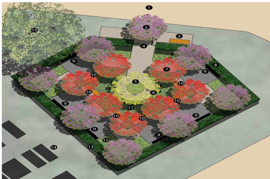
ST HELENS GENERAL CEMETERY

To see the design plans for this project visit www.bodc.tas.gov.au/council/current-works-2/ or contact our office.