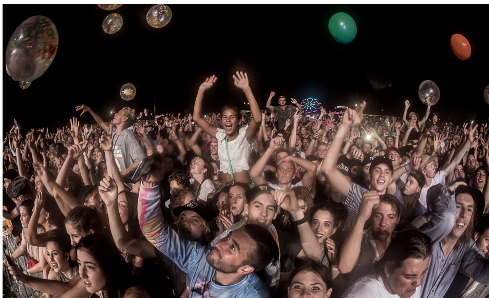
Geraldton One Night Stand.