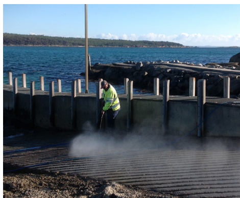
Boat Ramp cleaning