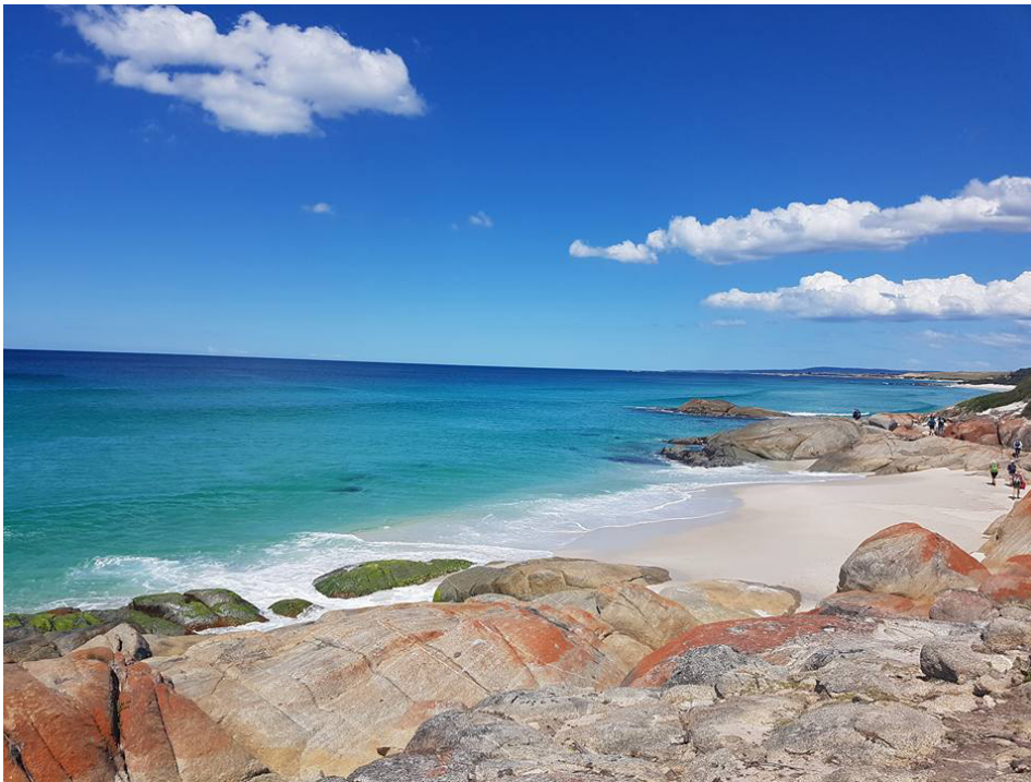
Photo taken on the 2017 Big Beach Walk