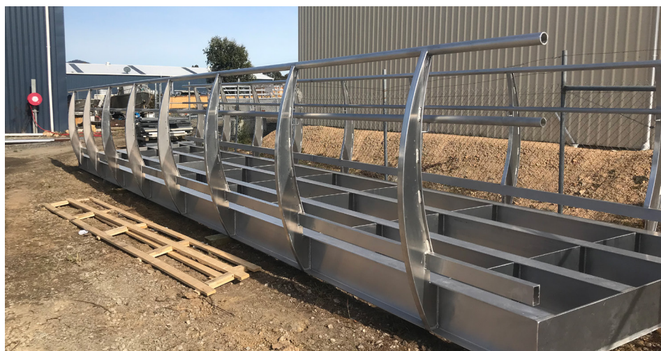
Above: One section of the new pedestrian bridge at Lyndcraft featuring the whalebone style.

Works are anticipated to be completed by the end of November.