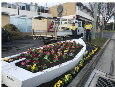
Pictured: Clint and Longey looking proud as punch of their flower planting job!

The works crew are pretty proud of themselves this year as they decided to get a bit creative and have planted the flowers around the boats to emulate sand, waves and the white wash of the waves. Well done fellas!