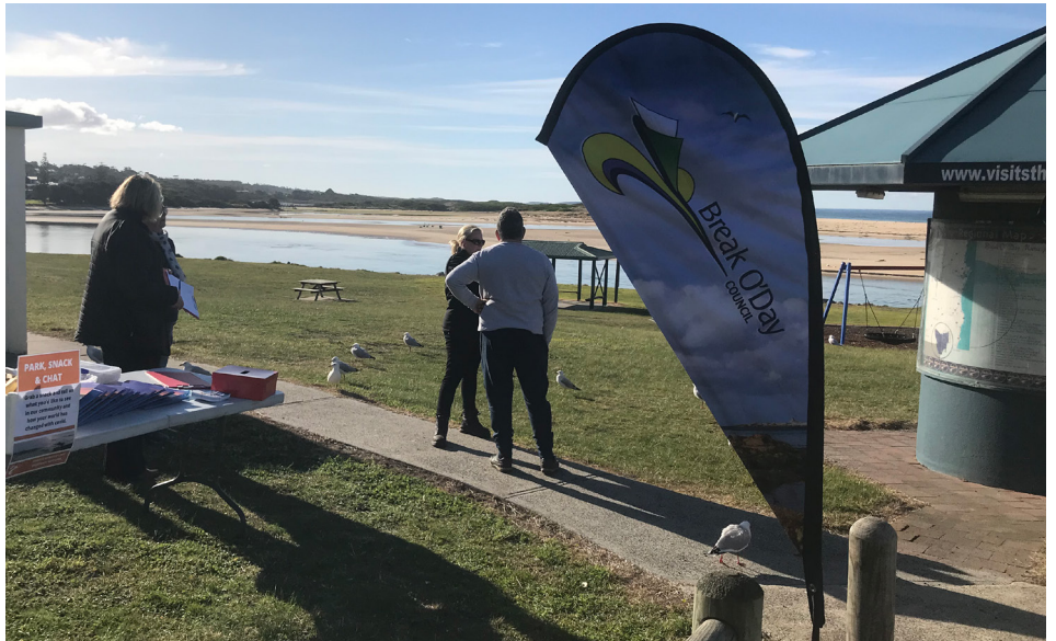
Above: Council Staff at the Scamander Park, Snack and Chat - Community Care Call pop-up event. Below: staff at Cornwall Community Hall and in the main street of St Helens.

Even though the last part of Winter is going to be chilly, hopefully we will continue to see fellow Tasmanians getting away from home to spend some time in our beautiful part of the State.