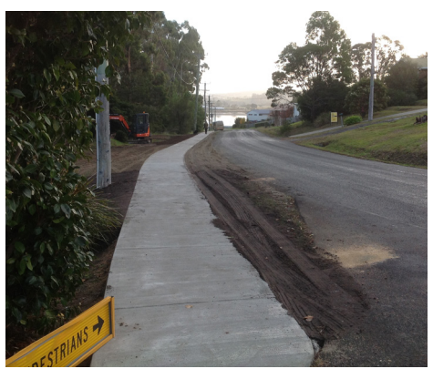
Penelope St footpath.