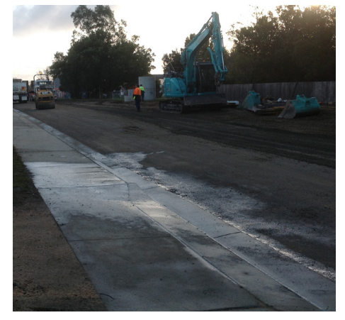
Annie St stormwater