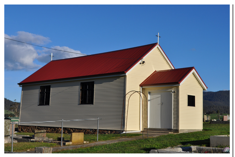
St Michaels and All Angels Church at Pyengana is one of the three churches in our area earmarked for sale.