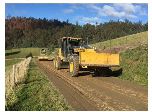
Lottah Rd grading