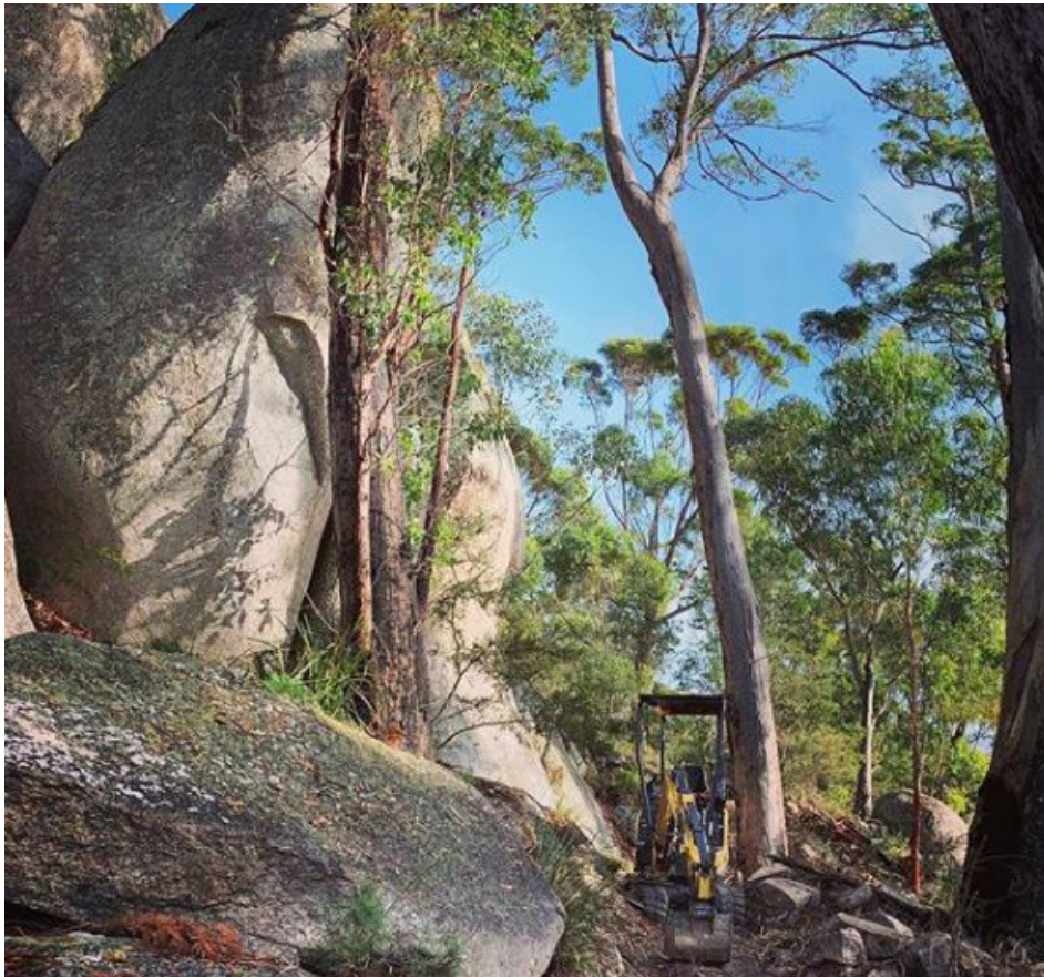
World Trail Crews working on the Bay of Fires Trail.

This specially curated exhibition, coincided with the Bay of Fires Winter Arts Festival and features pieces of artwork and historic items from the St Helens History Room's collections telling the story of a bygone era. Inspired by the rapid pace of change we are all experiencing, this exhibition takes us back in time. It is thought-provoking and topical as it explores our heritage and looks to our future.