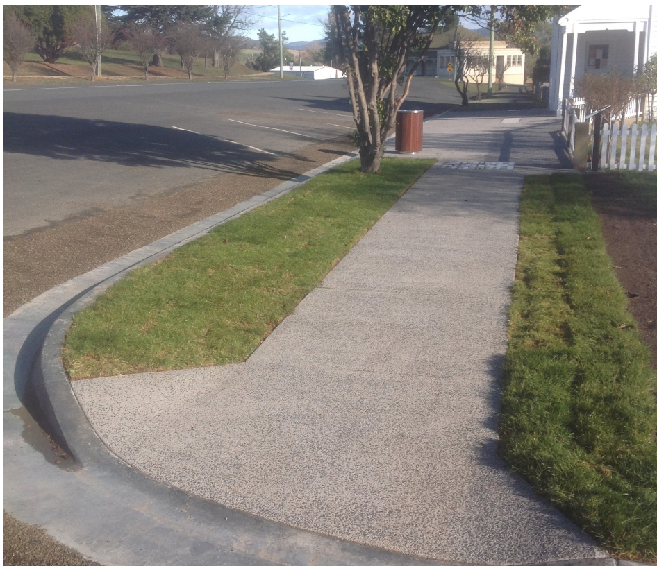
The Fingal Streetscape is now completed and looking great.

At the local level there is a group of local business and community members working on the St Helens Destination Action Plan which is fantastic to see. They will need all the support they can get so if you are involved in tourism or want to help out we can put you in touch with them. We also have an active tourism group working in the Fingal Valley under the umbrella of the Fingal Valley Neighbourhood House. The local Coordinator, Gary Barnes, plays a key role in helping them on a number of local projects. No doubt they also look for more community members willing to put their hand up and assist.