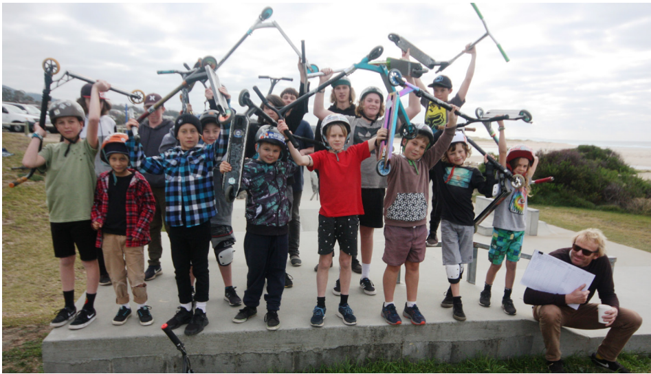
Some of last year's SCAMJAM participants.