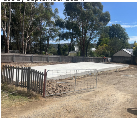
Photo: The Fingal Slab is currently underway with the slab being installed.

funding opportunities but we are hopeful to have the building open for use by September 2024.