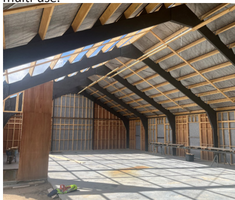
Photo: St Marys Evacuation Centre is drawing closer to 'lockup stage'

The new Indoor and Evacuation Centre will provide a new space for community activities such as a community gym, change facilities for the sports ground and will also provide catering facilities. This will be a flexible, indoor space for multi-use.