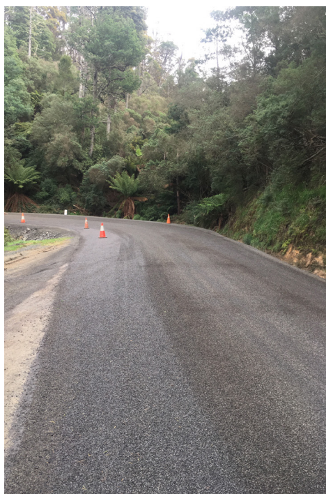
Pictured above, works on Lottah Rd. Pictured below, Autumn pruning.