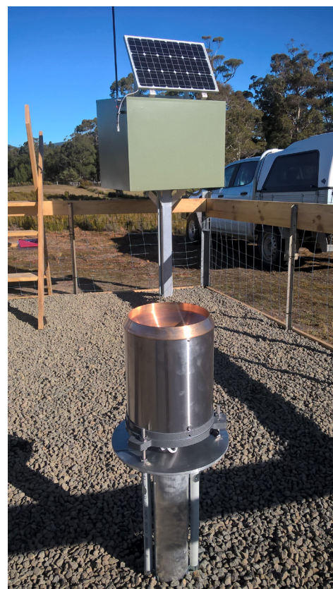
Above: The new weather station at St Marys

The Flash Flood Warning System is part of the St Marys Flood Mitigation project, funded by the Australian Government's Community Development Grants Programme.