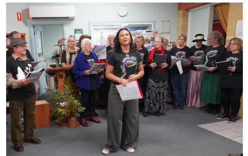
Photo: With One Voice Choir performs at the event.

members and invited guests for a night of live music, storytelling, quizzes and raffles, with many embracing the occasion in historical costume.