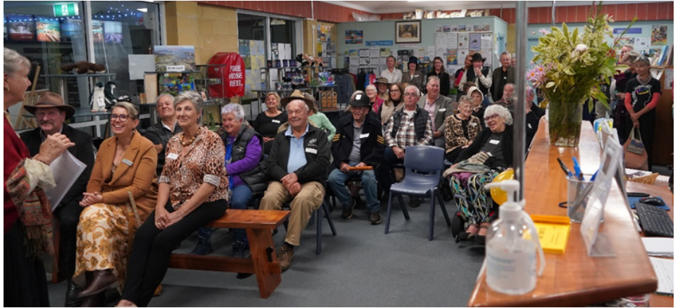
Photo: Community gathers to celebrate Break O'Day's rich history.

The St Helens History Room celebrated 40 years of preserving and sharing the stories, people and places that have shaped the Break O'Day community.