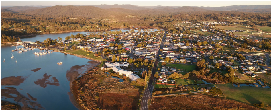
Photo: Aerial view of St Helens

St Helens has been recognised as one of Australia's top towns, ranking number 13 in a recent list of the nation's top 100 towns.