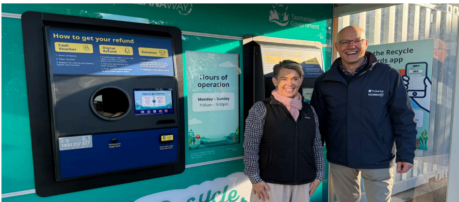
Photo: TOMRA employee and Deputy Mayor Kristi Chapple visiting the new Recycle Rewards Site in St Helens

Break O'Day will welcome its first Recycle Rewards reverse vending machine, with the new St Helens facility now open at the St Helens Sports Complex off Tully Street. The machine allows locals to return eligible drink containers and receive a 10 cent refund for each one.