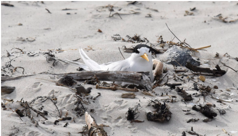
Pictured above: Fairy Tern in flight, nesting and a vulnerable chick on the sand.

Just like many humans, the Fairy Terns have decided to raise their families on beaches in our area.