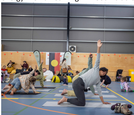
Photo: Participants enjoying yoga.

Organised by Break O'Day Council with support from volunteers and participants in the Break O'Day Community Wellbeing Project, the festival received funding from the Mental Health Council of Tasmania, the Tasmanian Community Fund, and Break O'Day Council. Visit the Festival page at wellbeingaction.org or follow the Festival of Wellbeing on Facebook to view a gallery of highlights from the day. There truly was something for everyone at our Wellbeing Day in Break O'Day!