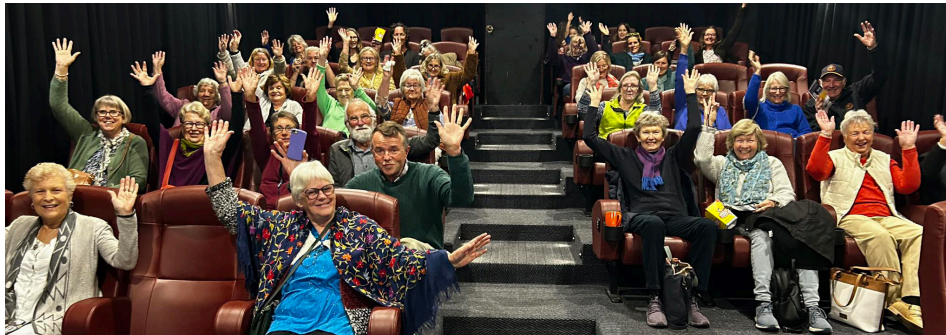
Photo: Volunteers and supporters enjoying the film festival