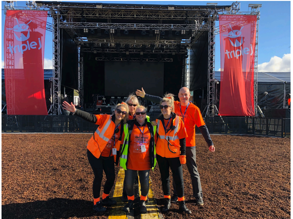
Members of the Break O'Day Council One Night Stand Team just before the gates opened.

As we progress into the formal part of the process with public exhibition of the Planning Scheme and Local Provision Schedules, it is important for the community to look at this information and take advantage of the opportunity to have their say whether it is to support what is proposed or suggest something else. That stage is still a number of months off and we will feel a sense of relief when we get to that phase.