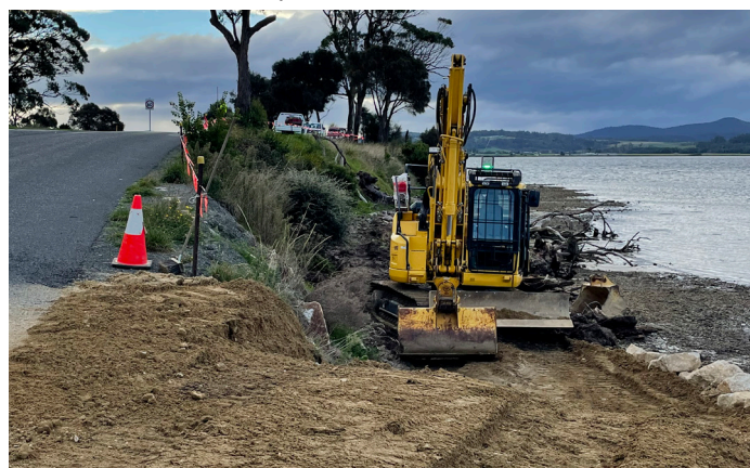
Pictured below: Footpath works near Parkside