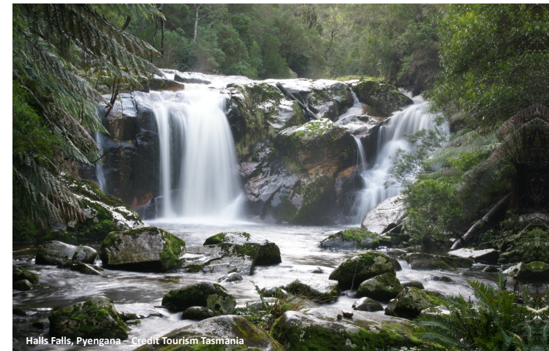
Halls Falls, Pyengana